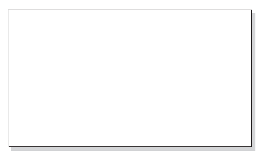
Figure 2.12 Conclusion of the Convention on International Civil Aviation, Chicago.

On December 7, 1944, 52 countries signed the treaty that resulted from the Convention on International Civil Aviation, which was held in Chicago, Illinois. Figure 2.12 contains an excerpt from that document.